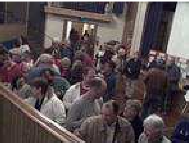
Community members voting on Focus Group recommendations for Leslie strategic plan.

A large crowd filled the Ozarks Heritage and Arts Center in Leslie on Monday, January 12, to hear the results of two months of work by Focus Groups on their community revitalization project.