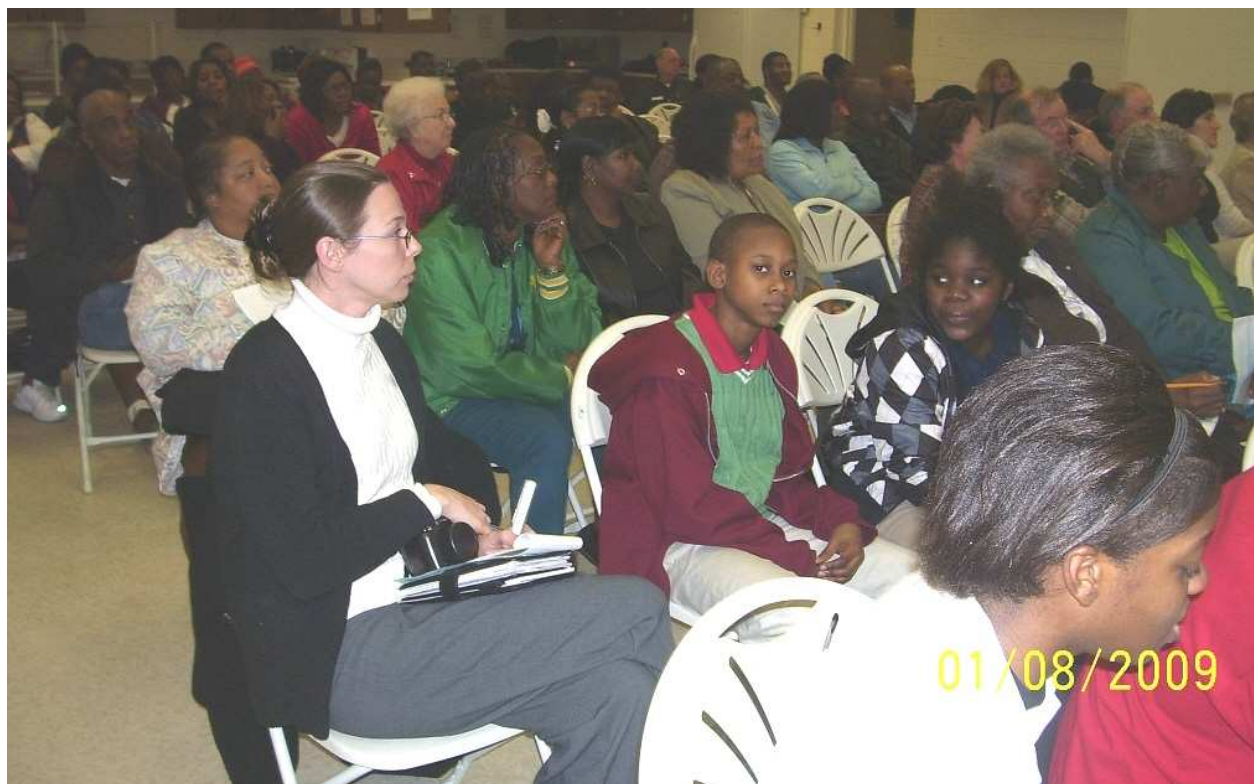
Eudora townspeople and guests attended a community forum for assessment on January 8 to kick off their revitalization project.

Ninety-two community members and guests were present on January 8 as the town of Eudora kicked off its Rural Community Revitalization project with Advocates for Community and Rural Education.